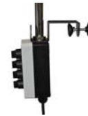
NT-190 Cubicle Mount