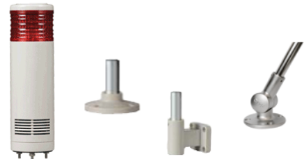
USB56LG NT-550 NT-560 NT-570