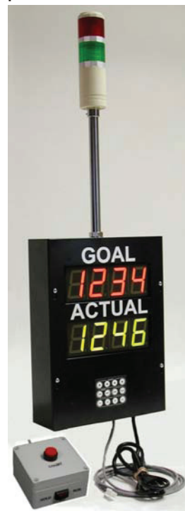
Sample Assembled Photo